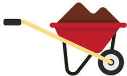
wheelbarrow 1m 32cm

5. Alexa has measured and is comparing lengths of items she has found in her shed.