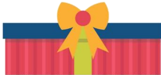
gift box 128cm